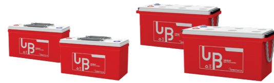
UNIBAT 80.12 AGM Ref 1573 UNIBAT 100.12 AGM Ref 1580 UNIBAT 150.12 AGM Ref 1597 UNIBAT 220.12 AGM Ref 1603