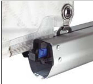
Inboard end The built-in sail feeder (moulded into the fitting) provides a guide for the mainsail clew.

The dinghy range of boom end fittings have been designed to provide an unparalleled level of functionality. Manufactured from inert, hard-wearing composite, these fittings offer multiple sheave lead solutions for outhaul, reefing, pole retraction, flatteners, or anything else you can think of.