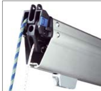
Lead options Additional to the integral gooseneck lock, the inboard boom end fitting offers three sheave lead options for outhaul, reefing lines, flatteners, internal pole retraction systems and anything else you can think of!