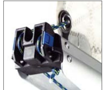
Outboard end Lines can be locked via two pegs on the side of the fitting or via a V-groove underneath the starboard sheave.