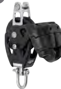
Single becket cam