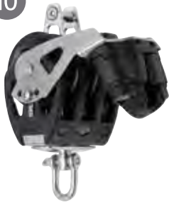
Triple becket cam