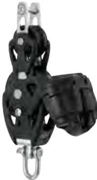
Fiddle becket cam