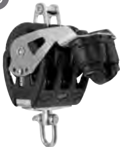
Triple becket cam