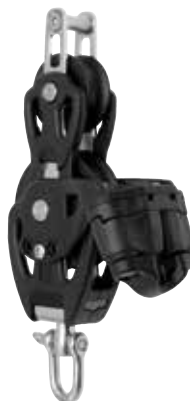
Fiddle becket cam