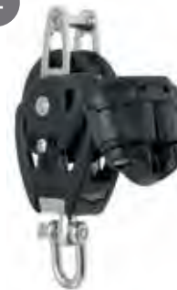
Single bucket cam