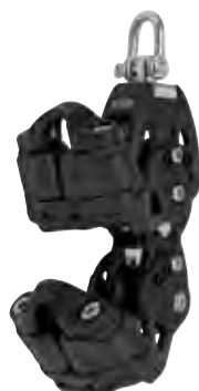
Fiddle, twin-cam For endless furling line used for Seldén CX and GX furling systems.

For more information about dimensioning, see page 94.