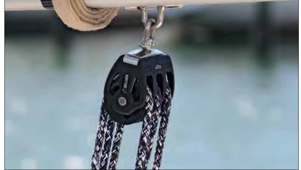
PBB 80 Triple

For more information about dimensioning, see page 94.