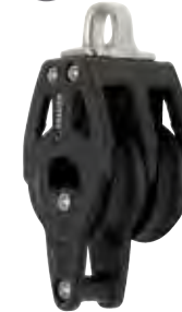
Double loop head bucket