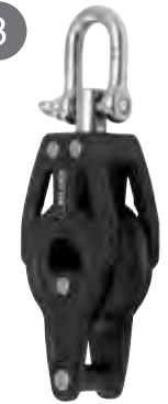
Single swivel/ fixed, bucket