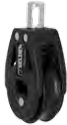
Sheet block, swivel with slot. (Incl. in 403-101-12R and System 15)