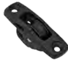
Single through deck