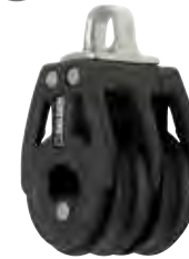
Double loop head