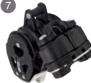
Triple loop head bucket cam