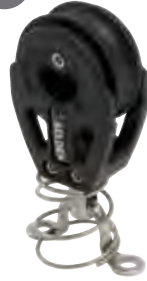
Single swivel, stand up