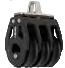
Triple loop head bucket