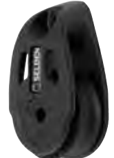
Single cheek cam