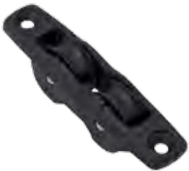
Double through deck

The centre hole can be used as a becket.