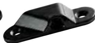
Sail Line Port (CL273) AL