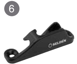
Rope entry from starboard (217 Mk1) AL