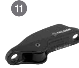
Quick lock and release function for trapeze or vang (253) AL