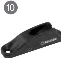
Roller for lines coming from below (230) AL