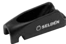
Fairlead (211 Mk2S2) AL