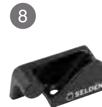
Rope entry from port (218 Mk2) AL