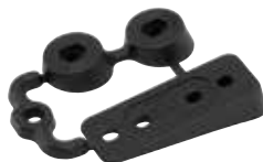
Tapered pad. Aids rope alignment for 432-014, 432-025 (823) PA