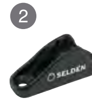
Standard (222) AL