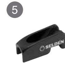
Fairlead. End of rope can be fixed under the cleat (270) AL