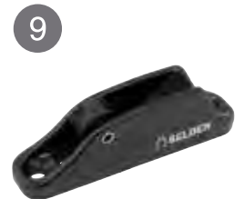
Roller for lines coming from above (236) AL