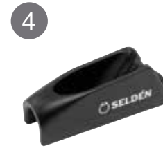
Fairlead (211 Mk2) AL