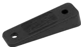
Tapered pad. Aids rope alignment for 432-023 PA