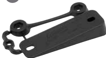
Tapered pad. Aids rope alignment for 432-012, 432-015, 432-016, 432-018, 432-026 (818) PA