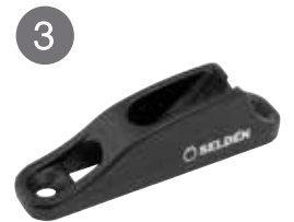
Fairlead (211 Mk1) AL