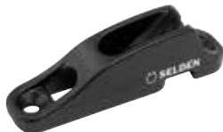
Fairlead. End of rope can be fixed under the cleat (704) AL