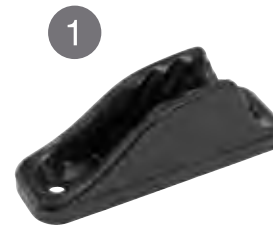
Standard (201) PA