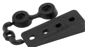
Tapered pad. Aids rope alignment for 432-013, 432-024, 432-017 (819) PA