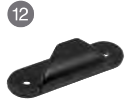
Fine line application in sail, starboard (258) AL