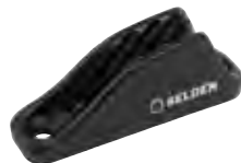
Standard (254) AL