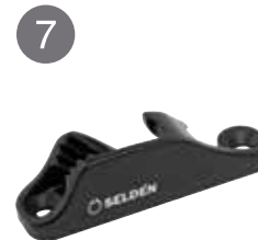
Rope entry from port (218 Mk1) AL